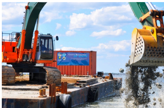
"Citizens Working Together for A Healthy Coast"